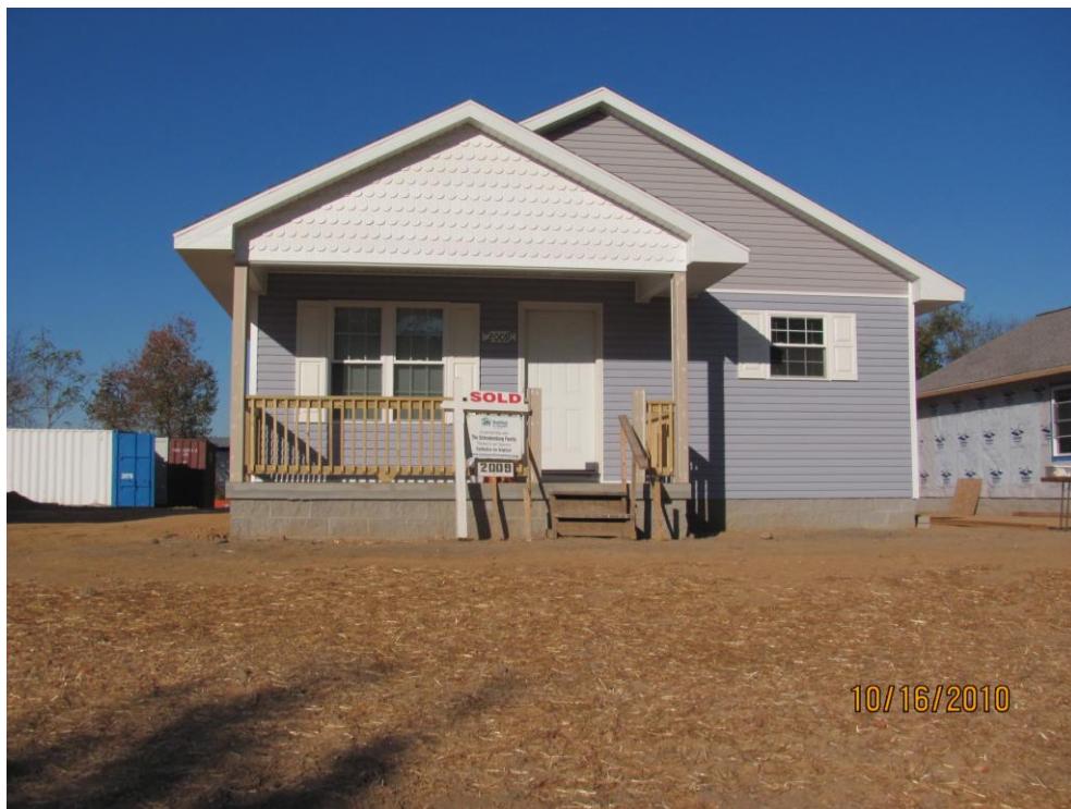
"The Schnakenburg Family Home"