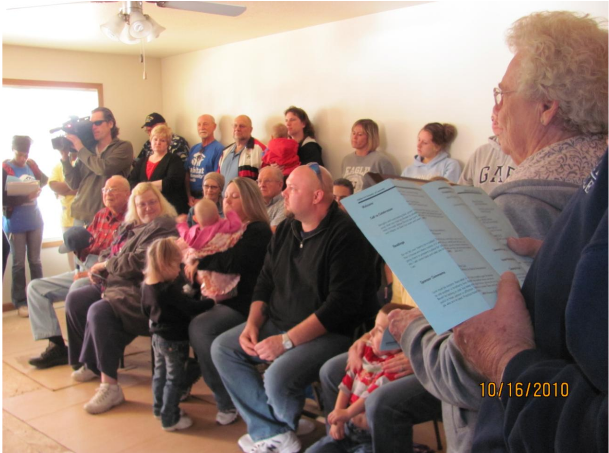
Family, friends and neighbors attend "The Schnakenburg" Family Home Dedication